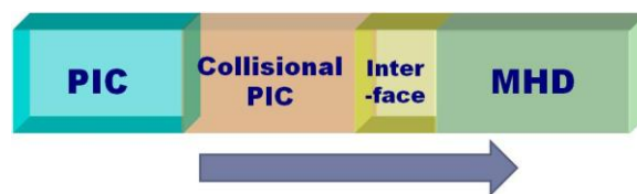
Fig. 2: Schematic diagram of the PIC - collisional PIC - MHD interlocking model, which mimics the downstream direction.