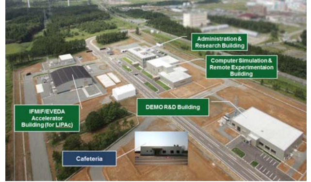
Fig. 1. International Fusion Energy Research Center established in Rokkasho, Aomori.

A new research site was established in Rokkasho, Aomori, for the IFMIF/EVEDA and the IFERC projects. The site is named "International Fusion Energy Research Center". Construction of the infrastructure including three research buildings was completed in March 2010, followed by the installation of research facilities and equipments. At present, about 180 people are working at the IFERC site.