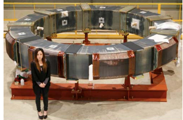
Fig. 5 Manufacturing of the EF4 coil was completed.

Two new buildings; coil winding building and jacketing building were constructed at Naka in 2009 for the procurement of the superconducting coils. The manufacturing of the EF4 coil was completed (see Fig. 5) and the manufacturing of the EF5 and EF6 has started. The first 40 degree Vacuum Vessel sector was delivered to Naka in March 2011. Up to now, three 40 degree sectors (120 degree) have been delivered. Another 120 degree sectors will be delivered by March 2013.