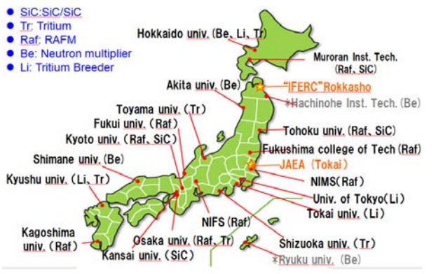
Fig. 3 Japanese universities and institutes involved in the DEMO R&D activities

DEMO Design Activities (DDA) has entered a joint work stage since January 2011. An integrated Project Team is constituted by the union of the DDA unit of the IFERC Project Team, European Home Team, and Japanese Home Team.