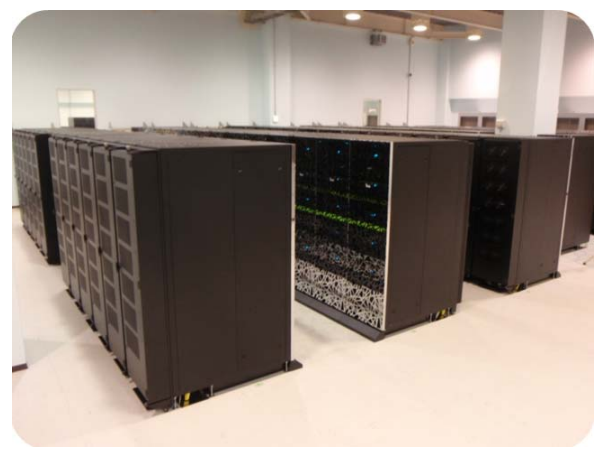
Fig. 4 Supercomputer 'Helios' in Rokkasho.

A high performance supercomputer with a LINPAC performance of 1.27 Pflops is now operational since January 2012 for the fusion simulation.