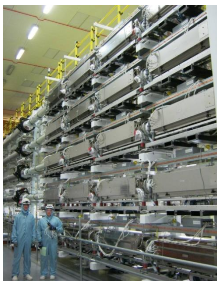
Fig. 3. The long-pulse beam-lines for ORION

The ORION laser facility at AWE plc, Aldermaston is also a ND:glass laser, similar in architecture to Vulcan. It is capable of delivering 5.0 kJ of 0.351 \mu\text{m} light to target in precisely shaped nanosecond duration laser pulses. Shown in Fig. 3 is one half of the nanosecond beam-lines delivered to target. The laser also has two petawatt beamlines, capable of delivering 500J/500fs pulses to target in orthogonal directions for pulse/probe experiments.