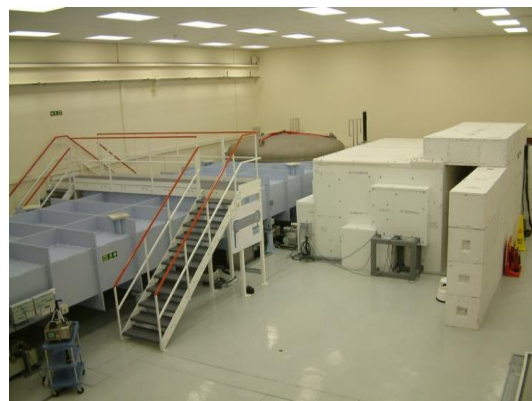
Fig. 2. The Vulcan PW target area.

At present, there are two targets areas. The first allows combinations of 100TW (100J/1ps) 50TW (500J/10ps) and pulses ranging from 80ps – 1ns. The second provides a petawatt laser pulse (500J/0.5ps) to target, as shown in Fig. 2. Typical experiments include equation of state studies, fundamental laser-plasma interactions, laboratory astrophysics and particle acceleration.