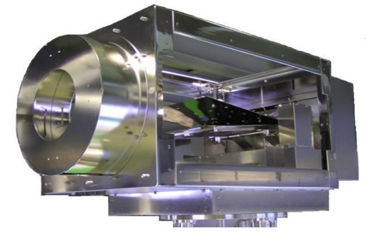
Fig 1 Divertor simulation experimental module (D-module). A V-shaped target plate which made of tungsten is mounted in D-module.

moves toward the plasma downstream according to increasing the angle. The dependence on various gases and the amount of gas is also investigated. In the poster session detailed results and discussion about the forming mechanism of the heat flux distribution are to be presented.